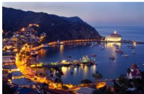
Catalina Island at night